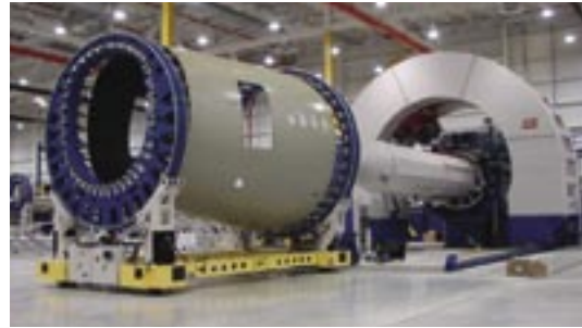
FABRICATION CART 🚚 With aft fuselage section.