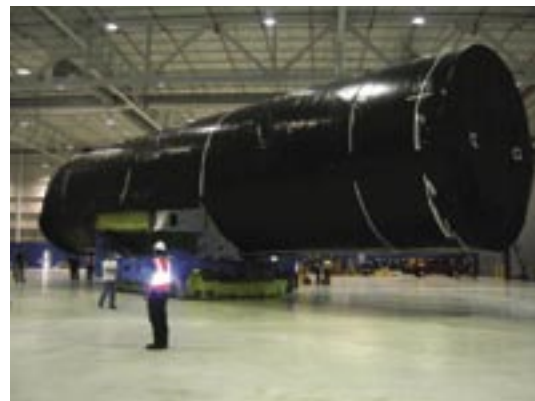
FUSELAGE TRANSPORTER 🚚 Transporting 787 Dreamliner fuselage.