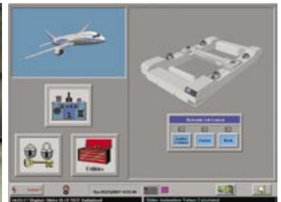
TOUCHSCREEN 🚚 The intuitive nature of the GUI touchscreen makes them extraordinarily easy to use.