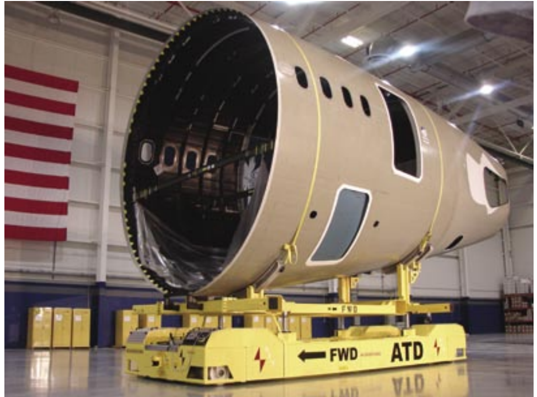
ASSEMBLY CART ⚡ Transporting a fuselage section.

U ltimate flexibility is a premium when it comes to maneuvering on a plant or factory floor during the aircraft manufacturing process. And AIT's Automated Guided Vehicles (AGVs) – customized to a customer's exact requirements – are designed with the maneuverability needed to transport and position any precision tooling, assembly equipment, people, and large structures.